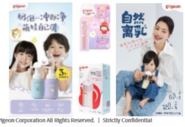
New products in the 2H of 2023 New series of drinking cups, etc.